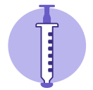
L.E.T. Topical Syringes