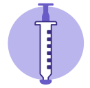
L.E.T. Topical Syringes